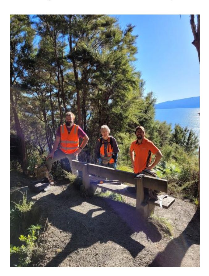
Images Page 4 and above: Post-cyclone trail damage being remedied on a volunteer day. Many thanks to our volunteers