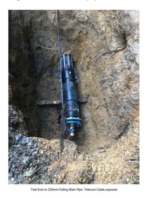
Pressure testing of the pipe installed near the Tawa Mountain Bike Car Park.

Pipe installation from the high point on Tarawera Road to the existing Okareka sewer pipe, covering approximately 1.8 km, is now complete. From here, Tarawera wastewater will be channelled through the existing Tarawera Road pipe to the Rotorua Waste Water Treatment Plant.