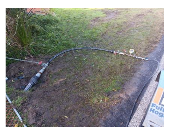
The first 900m section of the main from Spencer Rd to Alexander Rd being pressure tested.

In response to community requests, Council had previously pursued a lump sum price for Stage 2. However, the cost was deemed too high without further assessment of the construction market. Council instigated open market tendering for Stage 2 alongside Stage 1 construction, to identify the most economical method for Stage 2 construction.