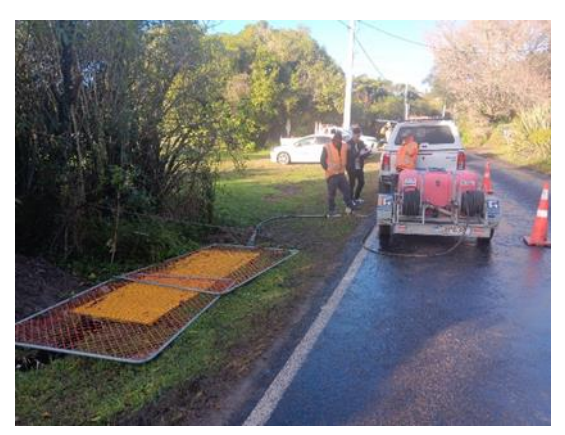
Contractors and RLC Engineering Cadet undertaking the pressure test.