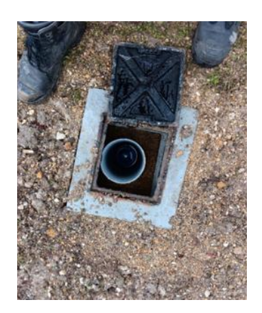
Valve for flush point.