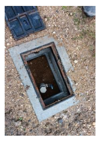
Flush point at the very start of the sewer main at the end of Spencer Rd.