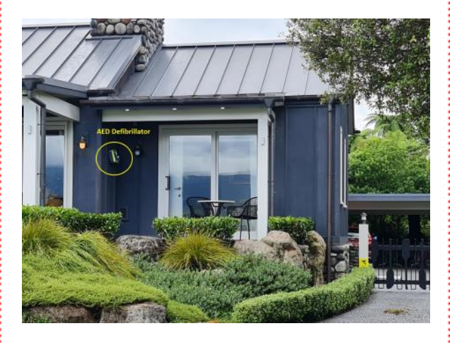
Private Property—Please Respect

This is the farthest house on the right of Rangiuru Bay as you look out to the lake Access across Rangiuru Bay Reserve or down Rangiuru Bay Road