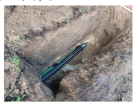
Sewer main alongside electrical conduit for the fibre communication between the pump-stations.