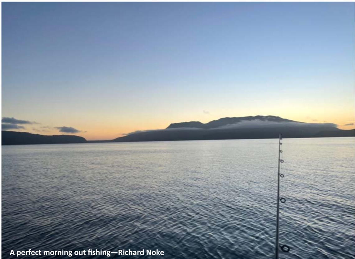
A perfect morning out fishing—Richard Noke

Call 111 for all fire and search and rescue emergencies