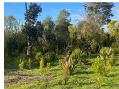
Rangiuuru Bay Reserve before (2019) ... and after (2021)